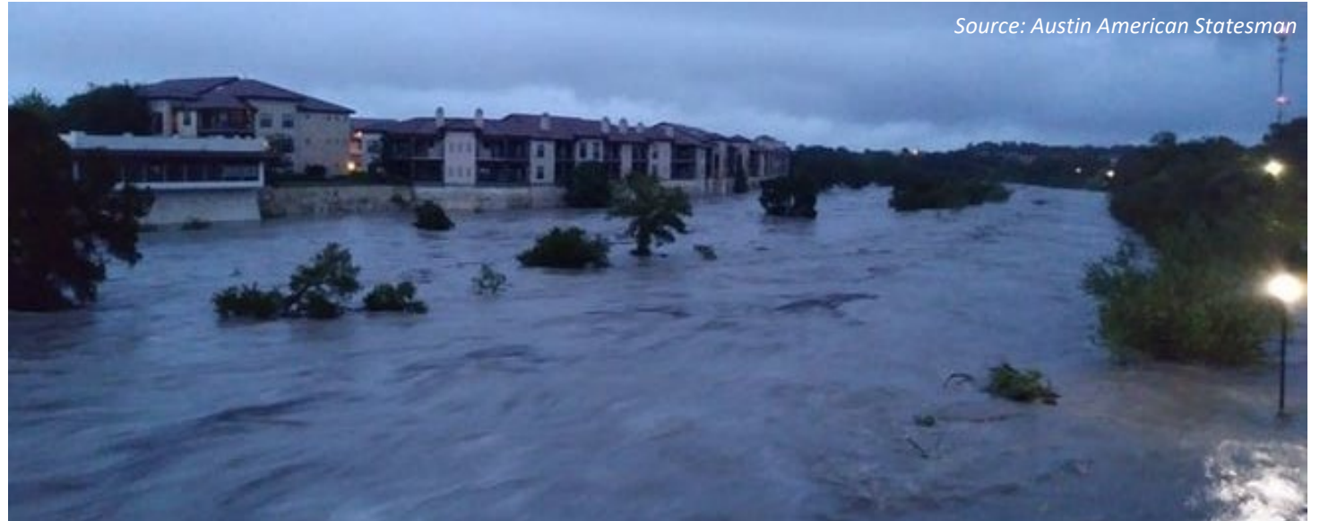
City of Georgetown 2018 Flood