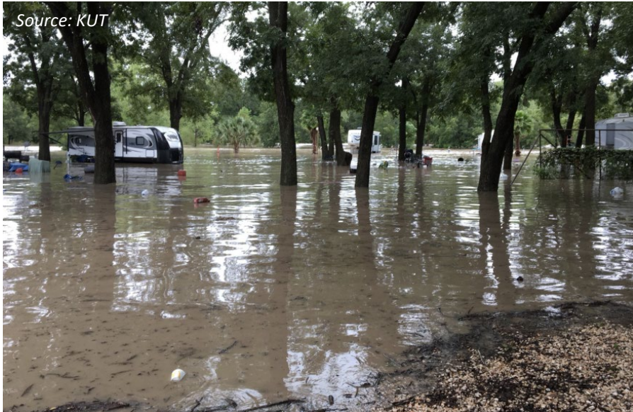
San Gabriel River 2018 Flood