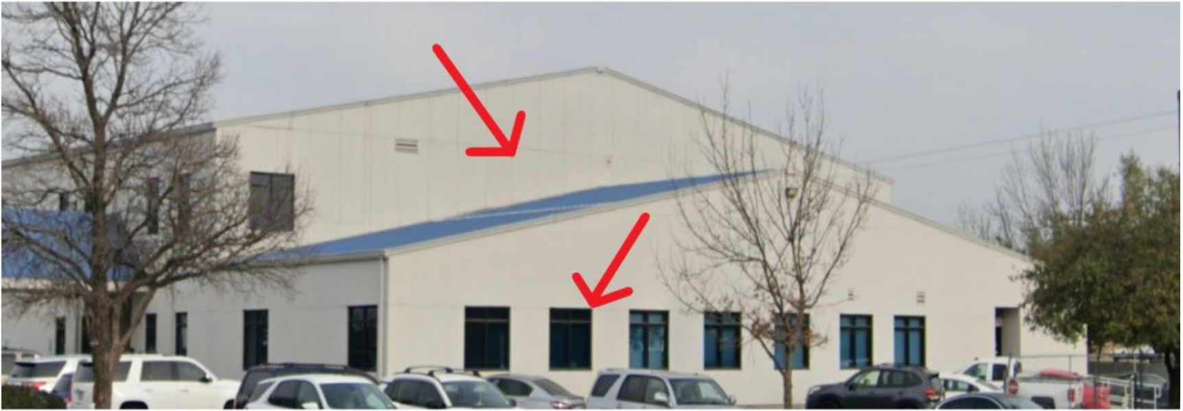
West Side of Building