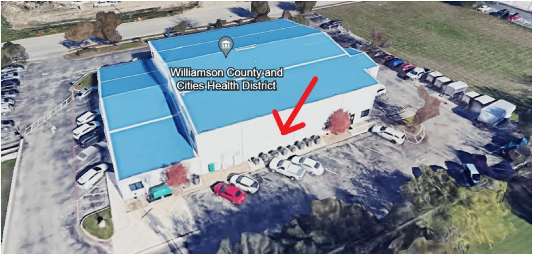
South Side ( Back of Building)