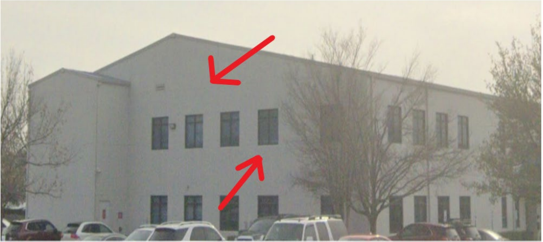
East Side of Building